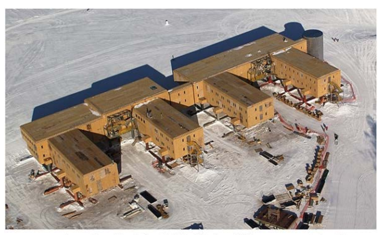
Amundsen-Scott South Pole Station

I wonder why he didn't mention the good news about Antarctic ice on the PBS segment.