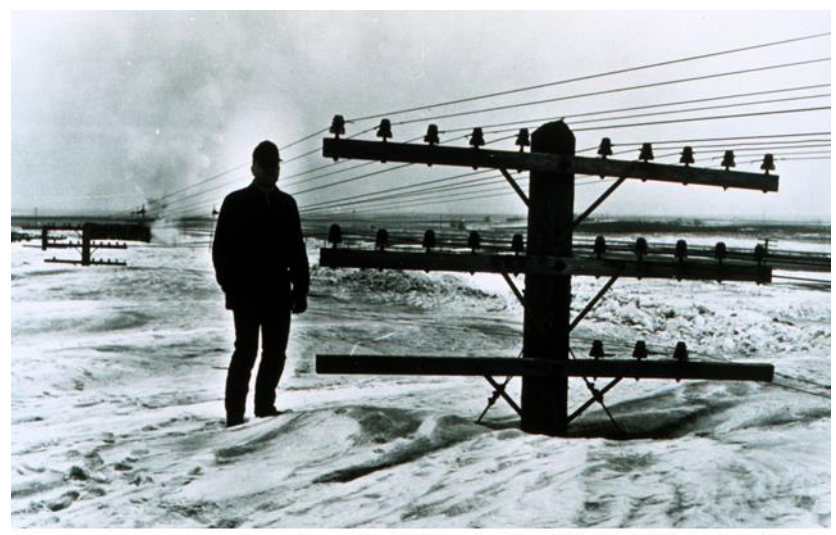
Jamestown, North Dakota, March 9, 1966