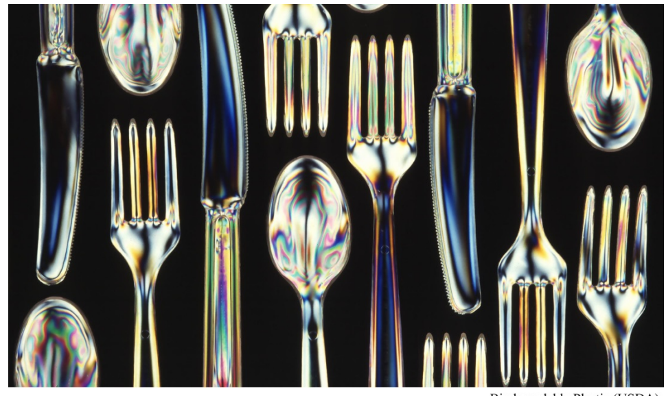
Biodegradable Plastic (USDA)