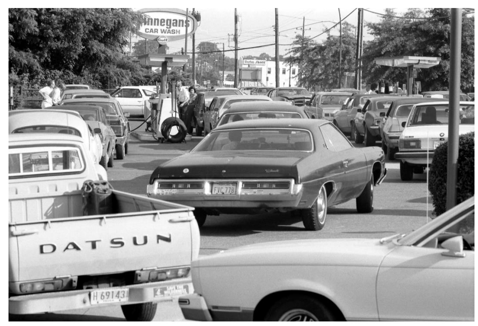
Maryland Gasoline Line, July, 1979